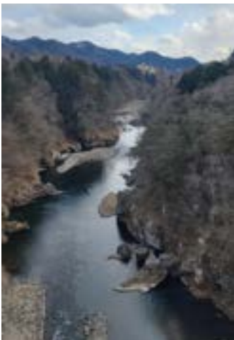
Wonderful view in Nikko