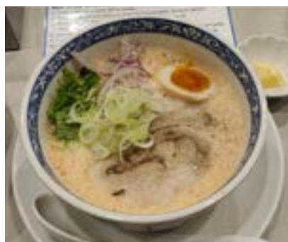
The best Soba I've tasted, おいしいです!