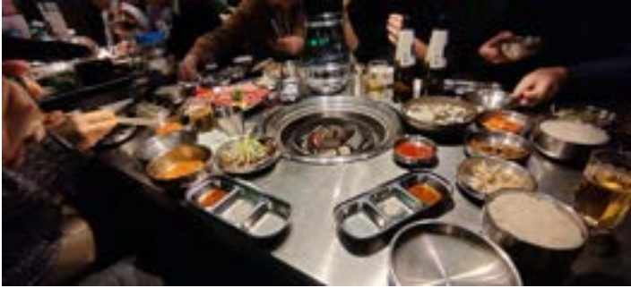
Korean BBQ with the team from TWIns on the first day よろしくお願いします :)

These 3 months were also my first time in Japan. I had a warm welcome in both places I've spent time in. On my first days here I could share a "new year" dinner with the team and although I was not able to speak a word of Japanese, I've met wonderful people and had a lot of fun! にほんごをべんきょうちゅうです during my stay but my skills are still poor... So until next time, I'll keep working on it! がんばります :)